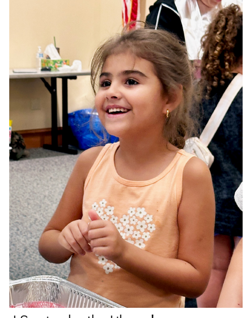
I Survived... the Library!

To see more of our summer photos, go to flickr.com/photos/scpl.