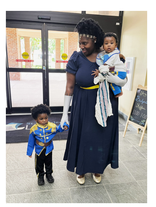
A Bridgerton Affair