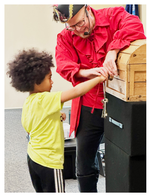
The Story Ship: Pirate Goodie & the Magic Chest