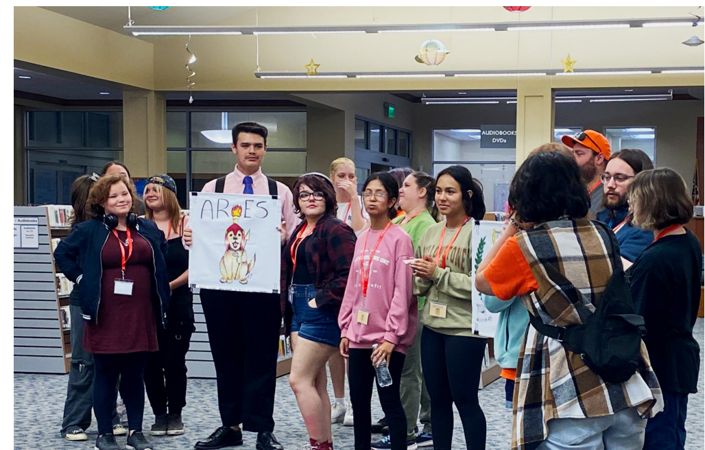
Percy Jackson Teen Lock-In