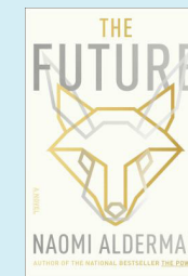
Future Naomi Alderman