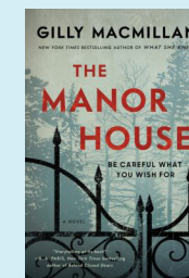
The Manor House Gilly Macmillan